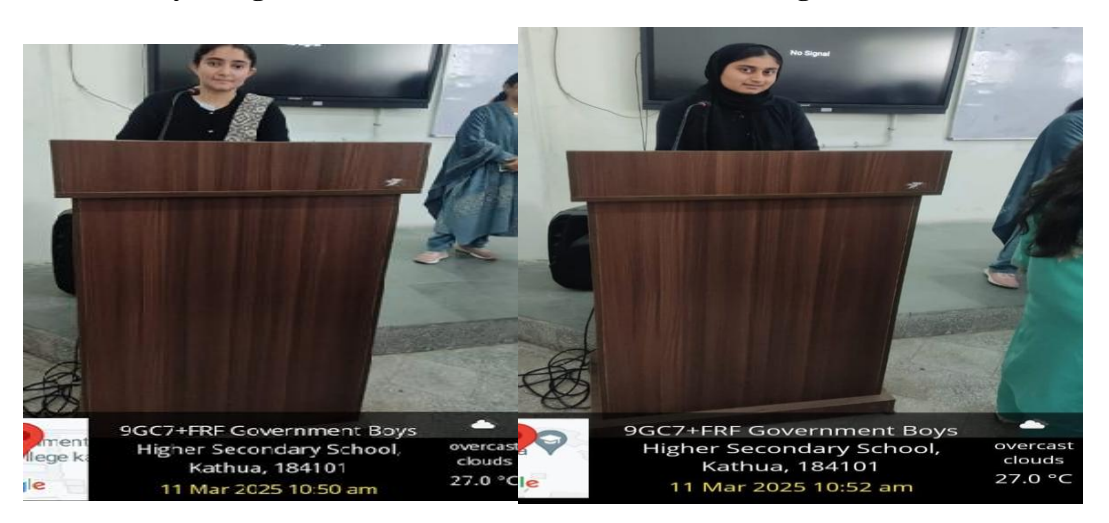
12. Seminar on the Theme "Protecting Children from Tobacco Industry Inference"