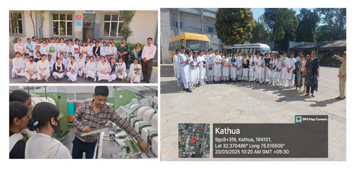
18. GDCW Kathua Organizes Two-Day Workshop on Women Empowerment

17. Government Degree College for Women, Kathua Organizes Educational Industrial Visit to CTM Kathua