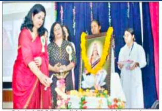
Principal GDC Kathua lighting ceremonial lamp at inaugural of national seminar at the college on Friday.

people and would also give tries, blood services face at large and by doing so the people of the soci-sufficient blood available, diac arrest, weight gain June 14 provides a special ity and safety. He told our nate many diseases as well opportunity to celebrate correspondent that the and we shall also be able donors around the world volunteers always ready mental wellness among the for their gift of blood and to help the needy persons people. The programme for action towards achiev- bring the slogan for 2023 a very decent way by Prof